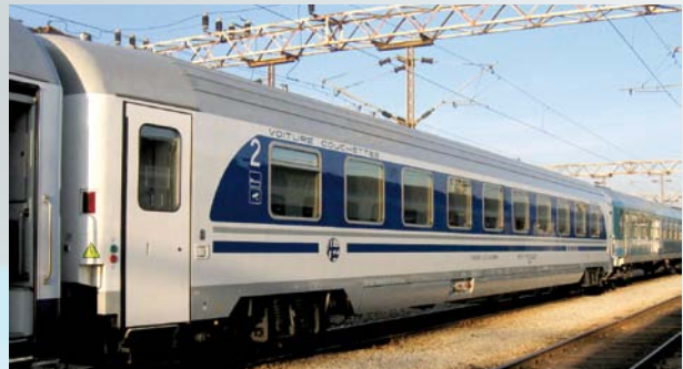
Croatian Railways couchette coach equipped with the converter KONTRAC PN60MS