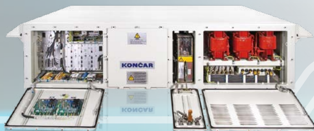
KONTRAC PN50MS / PN60MS for passenger coaches

KONTRAC PN50MS / PN60MS is used as the power supply for all consumers in modern air-conditioned coaches on European railways. It is powered by any of four UIC voltages and serves as the source of electric energy for the coach air-conditioning system, all single-phase and three-phase consumers, as well as for charging batteries and power supply of all DC consumers onboard a passenger coach. Switching to another UIC system is performed automatically and without external supervision.