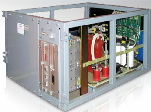
Battery charger module

KONTRAC PN6MS is a multi-system battery charger which serves as the source of electric energy for charging batteries and for supplying of all DC consumers on board the passenger coach. It is powered by any of four UIC voltages. Switching to another UIC system is performed automatically, without supervision. Modular design enables easy access and low maintenance costs.