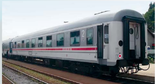
Modernized passenger coach series Bee 29-00 for local passenger transport in Croatia.