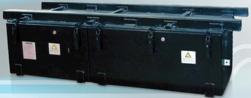
KONTRAC PN6MS for passenger coaches

KONTRAC PN6MS is a multi-system battery charger which serves as the source of electric energy for charging batteries and for supplying of all DC consumers on board the passenger coach. It is powered by any of four UIC voltages. Switching to another UIC system is performed automatically, without supervision. Modular design enables easy access and low maintenance costs.