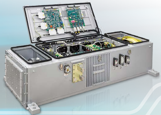
KONTRAC PN35DC for tramways

KONTRAC PN35DC is used as the auxiliary power supply converter in tramway vehicles. It converts 600 VDC or 750 VDC line voltage into three-phase AC voltage intended for supplying of tramway's air-conditioning unit, single-phase AC voltage for service purposes and DC voltage intended for charging batteries and supplying of all DC consumers on board the tramways.