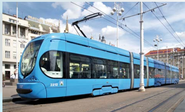
KONČAR tramway vehicle in Zagreb