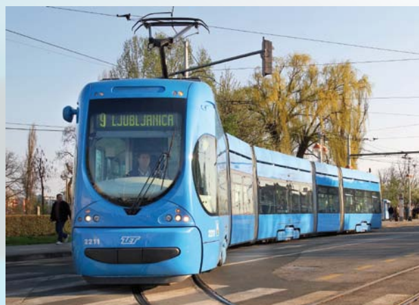
KONČAR tramway vehicle in Zagreb