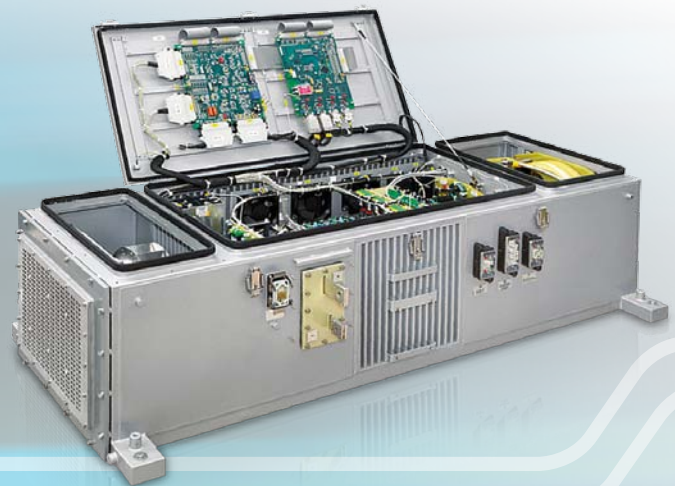
KONTRAC PN25DC for tramways

KONTRAC PN25DC is used as the auxiliary power supply converter in tramway vehicles. It converts 600 VDC or 750 VDC line voltage into three-phase AC voltage intended for supplying of tramway's air-conditioning unit.