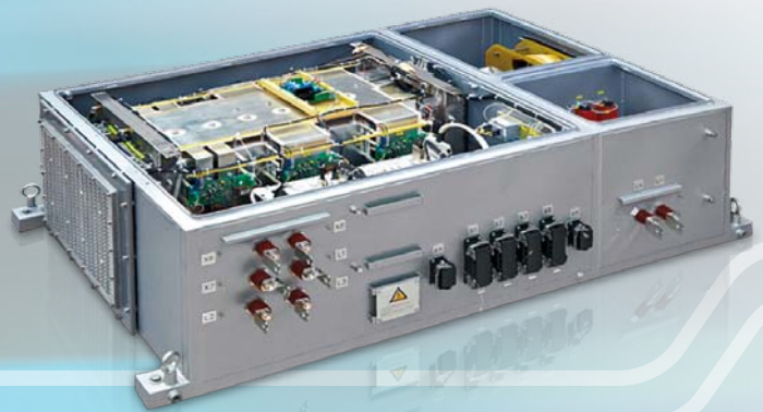
KONTRAC GP170DC for tramways

KONTRAC GP170DC converts 600 Vdc or 750 Vdc line voltage into propulsion power to control and drive asynchronous traction motors on tramway vehicles. The converter supplies two asynchronous traction motors connected in parallel. The electrical motor drive operates in two modes: traction mode and braking mode.