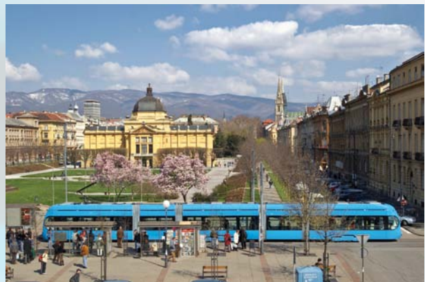
KONČAR tramway vehicle in Zagreb