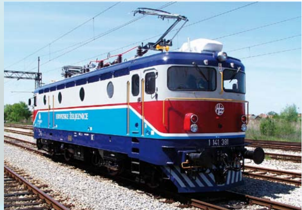
Thyristorized Bo' Bo' locomotive for Croatian Railways